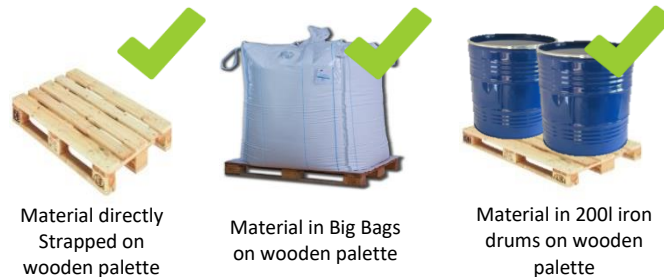
Material directly Strapped on wooden pallet